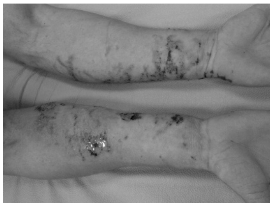
Figure 1 Rash present on patient's forearms on initial presentation to the emergency department.

There is only one other documented case of contact dermatitis after exposure to the sap, and in that case the patient's rash was also successfully treated with topical steroids and antihistamines. 2