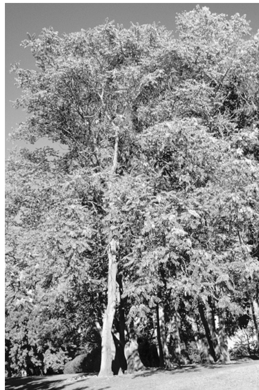
Figure 2 Tree of heaven ( Ailanthus altissima )