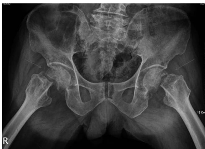
Figure 1 Pelvis radiography shows generalised osteopenia along with a bilateral femur neck fracture (arrow).

A 76-year-old man, without systemic disease but with progressive disability due to bilateral hip pain in 1 month, was brought to the emergency department. He denied any episode of trauma and was able to walk during his first visit to the emergency department. Pelvis radiography showed generalised osteopenia along with a bilateral femur neck fracture (figure 1). The patient was admitted to the hospital for bilateral total hip arthroplasty with Moore's prosthesis. Serum protein electrophoresis identified an M protein as a spike in the \alpha_2 , \beta or \gamma regions and a \kappa/\lambda ratio of 1096. The levels of haemoglobin and serum calcium were 11.5 and 8.5 mg/dl, respectively. Renal function was stable, with a creatinine level of 1.25 mg/dl. Bone marrow biopsy showed that 82.5% marrow cellularity consisted of plasma cells. A diagnosis of multiple myeloma was made. The patient is