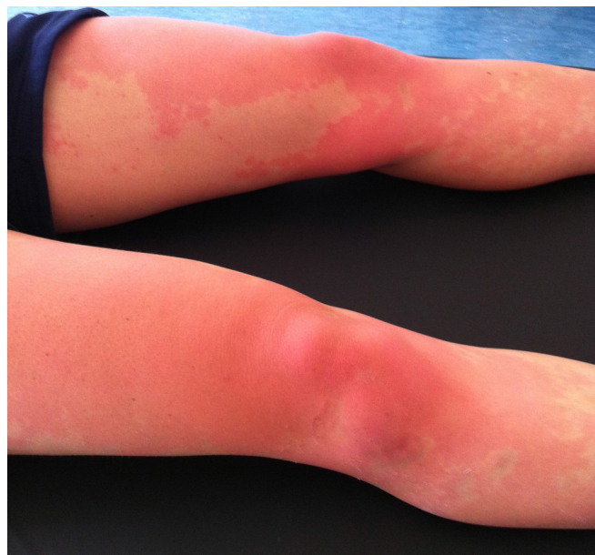
Figure 1 Patient's legs on presentation; this rash was generalised.