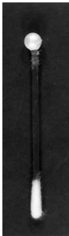
Figure 1 Foreign body (plastic pearl) removed in case 2 using cyanoacrylate glue. The pearl is still adherent to the hollow plastic tube used in the extraction.