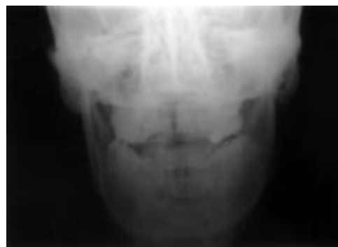
Figure 2 Posteroanterior neck radiograph showing the pellet in the anterolateral soft tissue of the neck.

upper anterior triangle of his neck. Surgical emphysema was not elicited. A 1 cm entry wound was noted at the middle portion of the anterior faucial pillar. Flexible pharyngoscopy revealed a bloodstained tongue base but no active haemorrhage. The airway was completely patent.