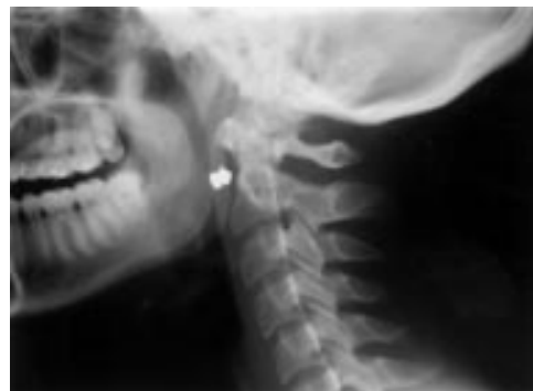
Figure 1 Lateral soft tissue neck radiograph showing the pellet anterior to the odontoid peg.

He looked remarkably calm on arrival at the accident and emergency department. There was no stertor or stridor. His cardiovascular status was stable. His oxygen saturation was 99% on air throughout the admission. There was minimal swelling and tenderness of the left