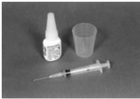
Figure 3 Medicine pot, needle and micropipette for dispensing the glue.

In clinical use glue strength is adequate at day 1 after opening. We have shown experimentally that this strength does not deteriorate over time.