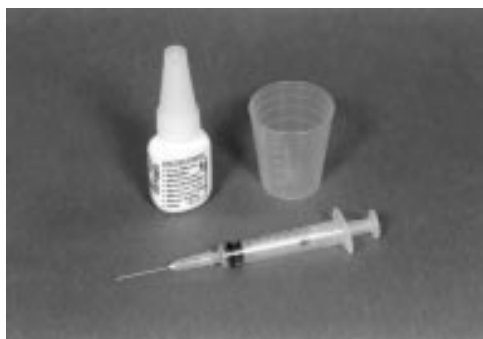
Figure 3 Medicine pot, needle and micropipette for dispensing the glue.

In clinical use glue strength is adequate at day 1 after opening. We have shown experimentally that this strength does not deteriorate over time.