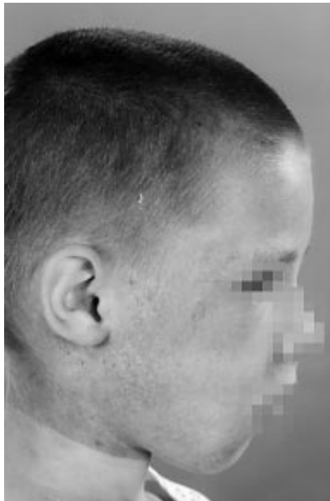
Figure 1 Case 2 showing the facial petechiae and subconjunctival haemorrhages, typical of ligature strangulation.

The treatment of both our patients was principally supportive with endotracheal intubation as necessary. Cervical spine injury has not been reported and is unlikely in ligature strangulation victims. As in one of our cases severe