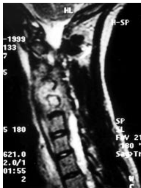
Figure 1 MRI revealing abscess around the 4th and 5th cervical vertebrae.

This case report is only the second recorded episode of an epidural abscess resulting from a dental extraction. 1 The diagnosis of an epidural abscess was made by MRI, which is currently regarded as gold standard. 2 The abscess is mainly caused by local and haematogenous spread. Blood cultures showed the presence of Streptococcus milleri , which is a known mouth