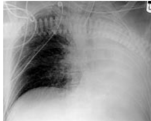
Figure 2 Chest radiograph after intercostal drain insertion showing the reinflated right lung. The mediastinum remains shifted towards the left.