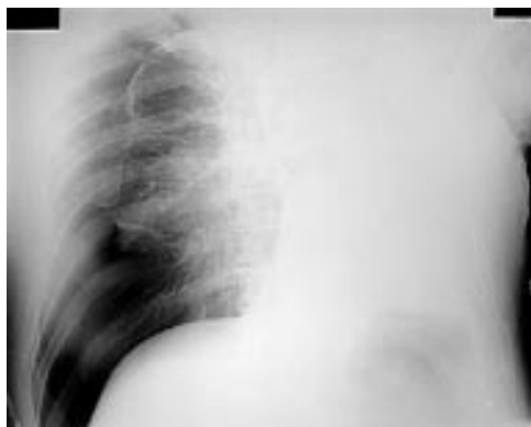
Figure 1 Chest radiograph showing a right sided pneumothorax and mediastinum shifted towards the left. There is a "white out" of the left lung field.