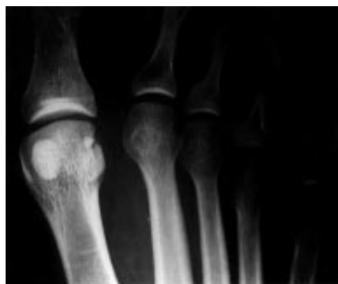
Figure 1 Anteroposterior non-weight bearing radiograph of the right forefoot showing a recent longitudinal fracture of the fibular sesamoid.

A 24 year old woman complained of pain and swelling plantar surface of her right great toe after spending many hours dancing in a night club. This was her principal social activity. Although tall, she wore high heels. Examination revealed tenderness localised to the fibular sesamoid and radiography (fig 1) confirmed a longitudinal fracture of this bone. Symptoms settled rapidly with conservative treatment including use of flat soled trainers.