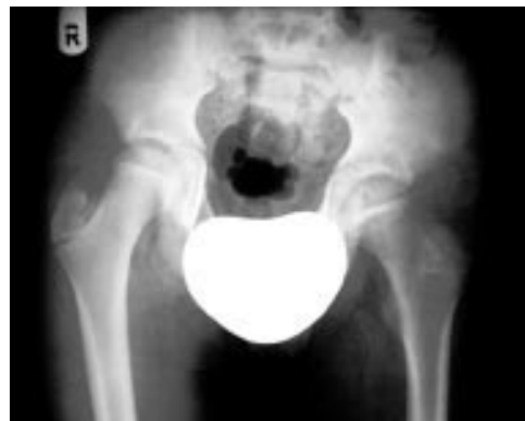
Figure 1 Calcified mass in the abductor mechanism of the left hip.

Myositis ossificans is the formation of mature bone outside the skeleton. Although it is an entirely benign condition, it is nevertheless an important condition because in its early stages presentation may be difficult to distinguish both clinically and radiologically from a soft tissue tumour such as rhabdomyosarcoma, which is the commonest soft tissue sarcoma in this patient's age group. 2 Other differential diagnoses would include a calcifying haematoma, slipped capital femoral epiphysis and septic arthritis. The other important learning point is that any child with a persisting limp should be evaluated radiologically with two views including a frog lateral because conditions such as slipped capital femoral epiphysis are easily missed on the AP view alone.