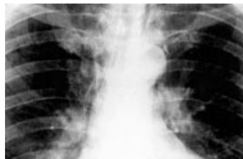
Figure 2 Chest radiograph showing pneumomediastinum.

Accident and Emergency Department, John Radcliffe Hospital, Oxford OX3 9DU, UK