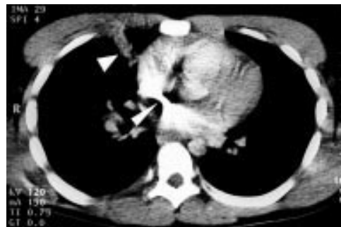
Figure 3 Thoracic computed tomography showing pellet within intra-atrial septum (narrow arrowhead) and missile track (broad arrowhead) through right lung.

0.22 pellet required to penetrate skin is only in the region of 75 m/s. 1 This case serves as a reminder of the potential of such weapons to cause life threatening injuries. Previous reports have illustrated the ability of air gun pellets to embolise from the heart as well as to cause arrhythmias 2,3 so consideration needs to be given to emergent removal with careful monitoring for potential complications.