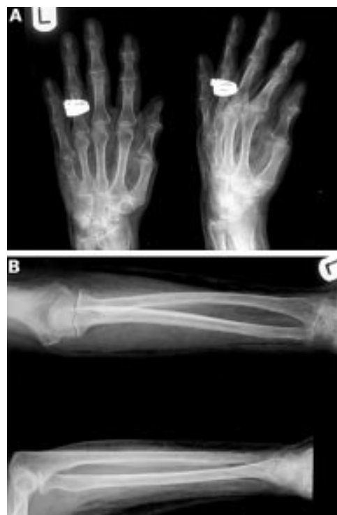
Figure 1 Subcutaneous emphysema of hand (A) and forearm (B).

Subcutaneous emphysema affecting an isolated limb is rare. It is important to differentiate between gas in the soft tissues secondary to infection and other causes of subcutaneous emphysema. Infection with gas forming organisms usually takes around 18 hours to produce clinically detectable crepitus. Subcutaneous emphysema from a non-infective cause is normally present much earlier. Signs of infection such as erythema, fever, systemic upset, and increased WBC count are not associated with non-infective causes. The presence of gas within the muscle bellies, as well as in the soft tissue, is suggestive of a deep seated infection with gas forming organisms. 1