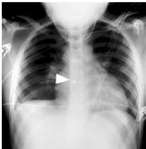
Figure 1 Anteroposterior chest radiograph with pellet (indicated by arrow) seen in mediastinum.

Accident and Emergency Department, Derriford Hospital, Plymouth, Devon PL6 8DH, UK A J Hudson