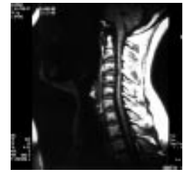
See p 172