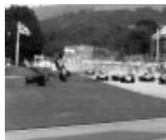
See p 468