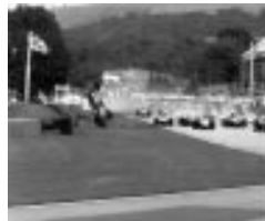
See p 468