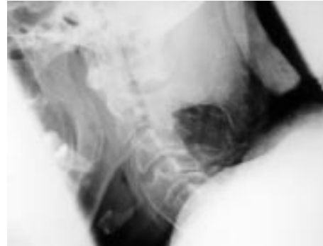
Figure 2 Lateral C spine radiograph showing reduction of C3/C4 fracture.

hip flexion grade 4 and some knee flexion and ankle plantar and dorsiflexion. His sensory level was unchanged. His neck was maintained in flexion and he was transferred to the spinal treatment centre where two days later he was noted to have almost normal power in his right lower leg, grade 2–4 in the left leg, grade 1–3 in his left arm, but grade 0 in his right arm. A diagnosis of an incomplete spinal cord injury was made with features of a central and posterior cord syndrome as well as a Brown-Sequard syndrome.