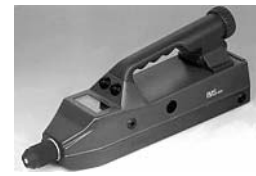
See p 84