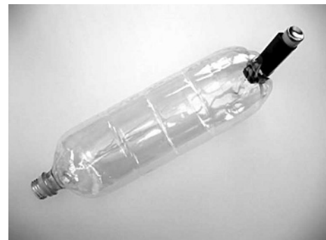
Figure 1 Improvised large volume spacer using plastic soft drinks bottle.

treatment of life threatening problems. For primary survey negative patients requiring hospital care the secondary survey may be undertaken during transportation. For the remaining patient population a secondary survey may be undertaken at the point of contact and will contribute to the decision to admit, treat and refer, or treat and leave.