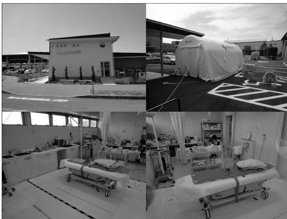
Figure 2 JV Medical Center (top left), decontamination tent (top right), examination rooms (bottom right and left).

The temporal increase in air dose rate did not show a concentric pattern, but it has been revealed that contamination was widespread northwest of 1F. 2,3 In Fukushima City, located approximately 50–60 km northwest of 1F, the air dose rate was \leq 0.1 \mu\text{Sv/h} at 09:00 on 15 March, increased rapidly around 15:00 on the same day and exceeded 24 \mu\text{Sv/h} at 18:00. Because it snowed overnight on 15 March, the rate remained at relatively high levels of 5–10 \mu\text{Sv/h} before gradually decreasing. A few weeks had elapsed since the disaster when the JV medical team provided medical assistance, and the JV Medical Center was located south-southwest of 1F; consequently, the dose rate measured outside the JV Medical Center was low at approximately 1 \mu\text{Sv/h} . According to the data obtained on 5 April, the air dose rates were 1–2 \mu\text{Sv/h} at the front of the JV Medical