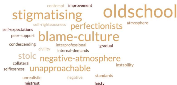
Figure 2. Culture word cloud

Culture has a far-reaching influence and is known to affect job performance, wellbeing and job satisfaction. The culture in the ED was purported to have improved but was commonly labelled as ‘toxic’ (see figure 2 for word cloud derived from unsolicited descriptions of the ED culture). As reflected in business management ‘culture eats strategy for breakfast’; the problematic culture, is likely to impeded positive change in other dimensions, and must be seen as a vital target and serious problem, rather than a ‘softer’ issue.